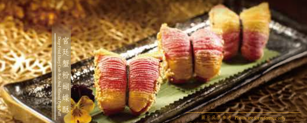
宮廷蟹粉蝴蝶酥 Deep-Fried Hairy Crab Roe And Minced Pork Puff

Deep-Fried Hairy Crab Roe And Minced Pork Puff (3pcs) ..... $78